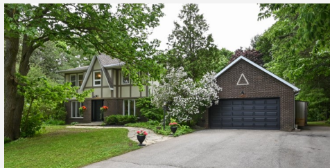
33 Old Carriage Rd, East Garafraxa MLS X6158152 $1,799,000.00