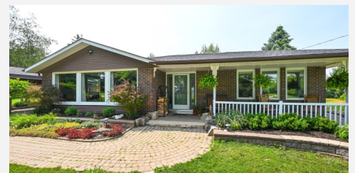
3348557 15th Side Road, Mono MLS X6213608 $1,599,000.00