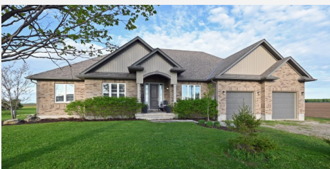
518217 County Rd 123, Melancthon MLS X5975972 $1,399,000.00

If you know of anyone looking in our area... For more info on any of these listings give us